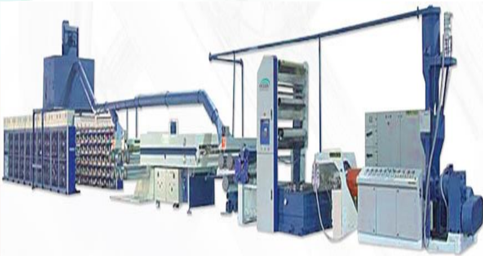
RAFFIA TAPE STRETCHING LINE MACHINE